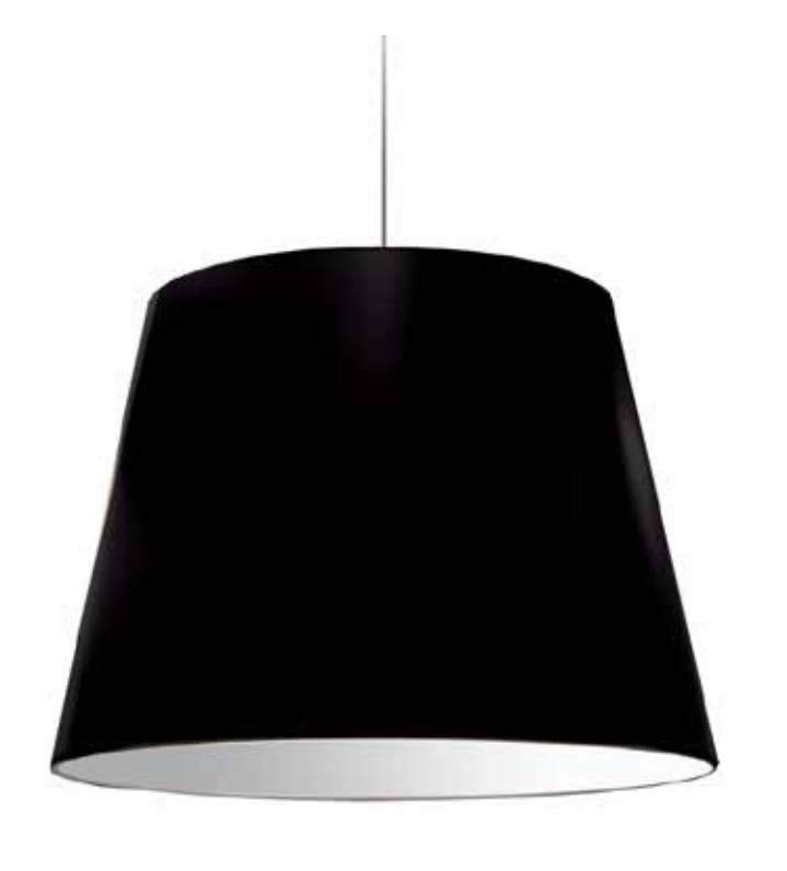
1 Light Oversized Drum Pendant Large Black Shade